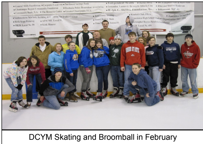
DCYM Skating and Broomball in February

It's hard to believe that Easter is right around the corner, so remember the Youth will be leading the Early Worship service at 8 a.m. with breakfast to follow at 8:30. This service always showcases the talents of our young people and helps them to stretch their comfort zone a bit. Due to Easter and Spring Break, there will be no Youth Group on April 4, 18, or 25. Youth who are not traveling for Spring Break should plan to meet on April 11. We will be back with a full schedule of meetings on Sundays in May!