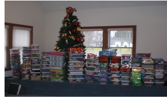
(Shoebox donations from 2010)

Operation Shoebox 2011 is on its way! Ken and Katie are gearing up for a great collection this year and offer the fol- lowing details and ideas: