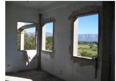
The Corner Office (actually, the Lab)