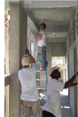
Painting at the clinic