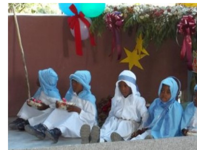
And of course, the kindergarten students were precious!